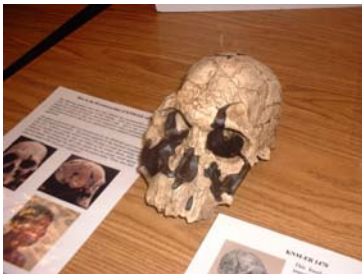
Replica of KNM-ER 1470, used in the discussion of fossil reconstruction, bias, and manipulation.

Skull replica of a Neanderthal. This specimen was unearthed in Europe.