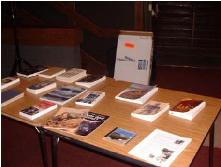
Books and literature on display.