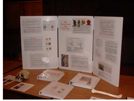
Poster display— "The Genesis Flood and Early Man."