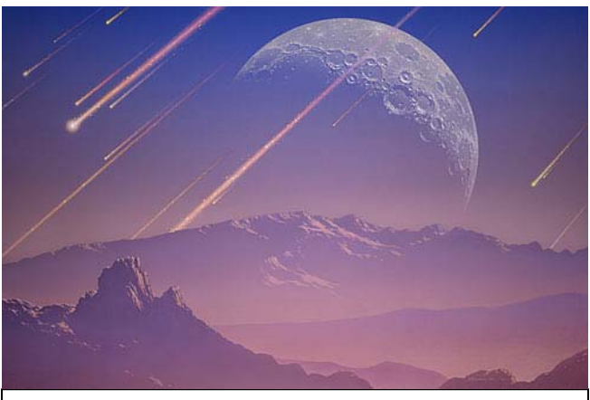
Figure 8. Because of the sin and rebellion of Satan and the angels the Bible indicates there was war in heaven. This heavenly battle caused much astronomical and geological chaos to the earth.

surface and the solar system. There is ample evidence of ancient catastrophic events in the solar system. These include but are not limited to the following: the craters on the moon, the rings of Saturn, Uranus, Neptune, and Jupiter, the asteroid belt which is the complete shattering of another planet, the erratic orbit of Pluto, and Uranus' smaller moon, Miranda, being shattered and then reformed. The whole solar system has scars of past planetary catastrophes. On the earth large craters caused by comets and planetoids have pockmarked its surface. See figure 8 (40). Also the earth has thousands of feet of strata rich in fossil deposits, which indicate that the earth has been through at least one other