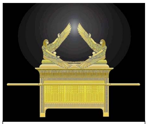
Figure 7. The Ark of the Covenant, showing the covering cherubs with their outstretched wings. This symbolized God's throne in heaven. Satan was once present at the throne room of God; he is called "the anointed cherub who covers..."

The 28th chapter of Ezekiel describes the spiritual career of Satan. It illustrates when he was originally created he was perfect in wisdom and beauty. He was one of the cherubs that covered the throne of God with his wings. This is typified by the lid, which covered the Ark of the Covenant (Exodus 25:17-22). This lid often termed the mercy seat, where the High Priest went to obtain mercy in God's presence, had two angels (36) covering it with their outstretched wings. See figure 7 (37). Originally Satan was one of the cherubs that covered God with his wings. Satan was an observer of the events that took place in the throne room of God. Satan had a top position in the most important place in the Universe the holy mountain that refers to God's headquarters.