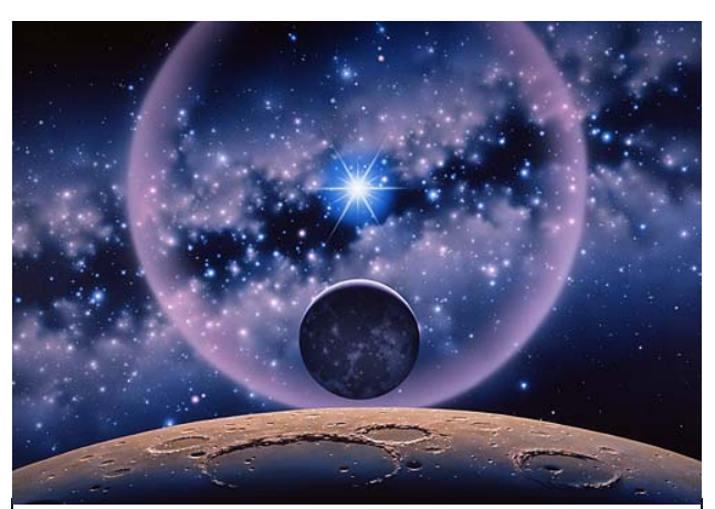
Figure 1. The creation of the heavens and the earth is the topic of the first chapter in Genesis. Were they created only a few thousand years ago or are the heavens and the earth older?

• One perspective states that verse 1 is actually part of the first day of the creation week, and that these events all take place in one twenty four hour period. In this model everything that exists spiritually and some natural phenomena were brought into being in one twenty four hour period. This would include angels, heaven—the abode of God, time, energy, before this day only God existed. The adherents to this model are often called.