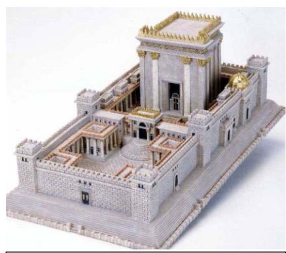
Figure 6. A model of the second temple enlarged by Herod. Like the first temple built by King Solomon they were both built out of white limestone a fossil rich rock.

Solomon's temple was built out of white limestone, see figure 6 (33). King Solomon commissioned King Hiram of Tyre to quarry the stones. King Hiram had 80,000 stonemasons (1 Kings 5:15, 17-18) involved in quarrying the limestone used in the foundation and the walls of the temple. White limestone was used because it is easily worked and when it is finely polished it resembles marble. Limestone is a sedimentary rock that is fossil rich. This means that the temple foundations and walls are built out of rocks, which are mostly fossilized remains of dead carbonate animals (34). It would be impossible for God to have called the temple holy using the Young Earth Creationist's standard for holiness.