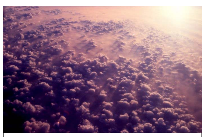
Figure 4. On the fourth day of the re-creation account God allowed the sun, moon, and stars to be visible to an earthbound observer. He did this by clearing the atmosphere of suspended dust, dirt, and clouds.

Verse 16 occurs on the fourth day. What happened on this day is that the heavenly bodies which were created prior to the creation week and already existed were at this time brought forth or appointed to be the rulers of the night and day. What apparently happened is the atmosphere cleared enough that the previously hidden sun, moon, and stars appeared to an earthbound observer. See figure 4 (19). Notice that the words "He made" are in brackets indicating that this is not part of the original Hebrew. The stars were also appointed not created at this time period the fourth day of the re-creation week. A more correct translation should read as follows: