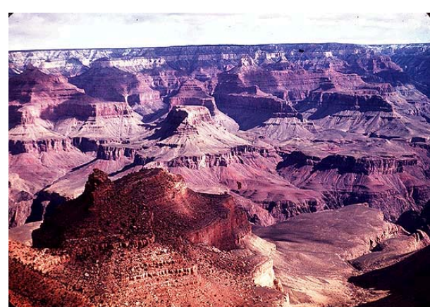
Figure 2. According to the Young Earth Creationists the gap theory is of recent origin and was only formulated to counter the rise of modern geologic theory and its need for the earth to be older than a few thousand years—is this true?

The modern gap theory was proposed in 1814 by Thomas Chalmers, a leading Scottish theologian. Some geologists of his day had argued that the earth was much older than